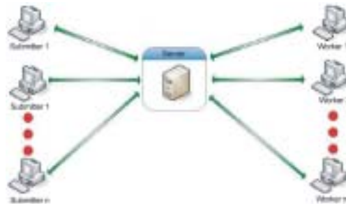
Fig. 1: Lakes Environmental HIVE Grid Architecture