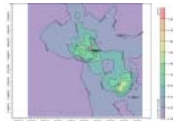
Fig. 4: SO 2 concentration from a 5-day simulation