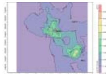
Fig. 5: New SO 2 concentration when emission rate increases by 4 times