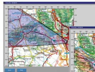
Traditional Model Results