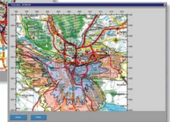
SEVEX View Model Results